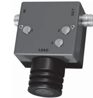
T-1030 SINGLE ISOLATOR

All of these conditions will cause large amounts of power to be reflected down the transmission line toward the transmitter. The circulatory property of the isolator will direct this energy to the load port, and protect the transmitter. The load on the isolator must be capable of handling full transmitter power. Age, water invasion, and incorrect cable length will also cause impedance changes. The tuned ports of the isolator provide a constant 50 ohm impedance for the transmitter to avoid overheating and oscillation.