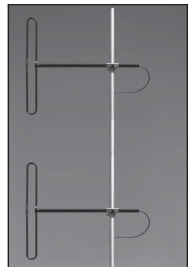
ANT120D3 (Harness not shown) Support mast is customer-supplied