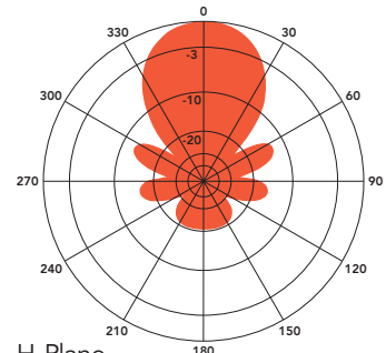
H-Plane Gain: 10.2 dBd