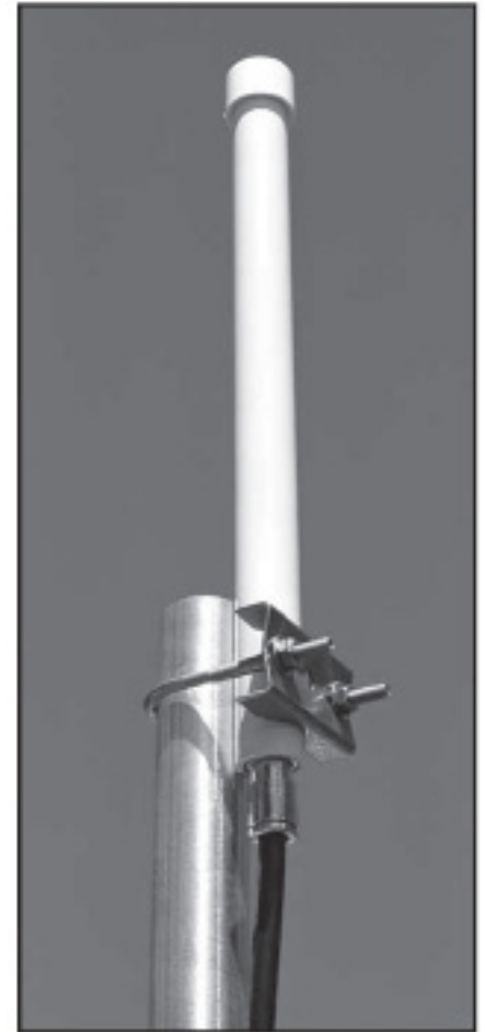
Shown with optional clamp

The Telewave ANT960F0 "Data Stick" is a rugged, economical omni antenna for wireless data applications in the 900 MHz band. The antenna is constructed entirely from brass internal components, and the durable radome is designed to withstand severe weather and environmental conditions. The radome will not corrode or degrade as a result of exposure to UV, salt water, oil, or most common chemical fumes. Optional mounting hardware is available for various applications. IP24