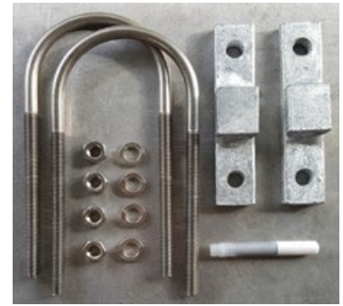
ANTC485 Clamp Kit