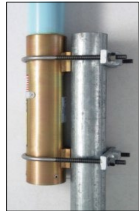
ANTC485 Typical Installation