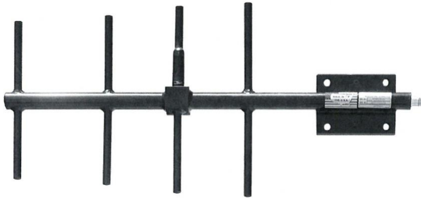
ANT380Y7-WR at 390 MHz