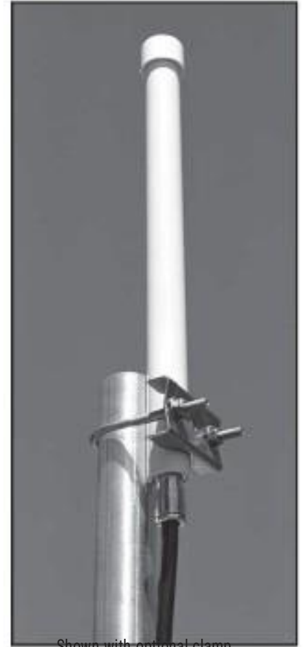
Shown with optional clamp