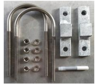
ANTC485 Clamp Kit