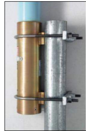
ANTC485 Typical Installation