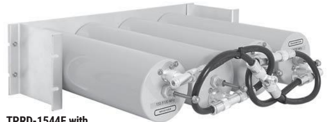
TPRD-1544F with TWX-5 spacers

The Telewave.io TPRD-1544F allows simultaneous operation of a transmitter and receiver into a common antenna. This pass-reject duplexer utilizes folded four-inch cavities to achieve high "Q" in a compact size.