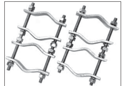
Figure 2: Clamp Preassembly